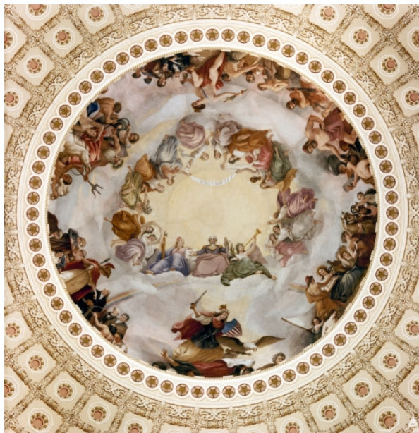
Fig. 11: Constantino Brumidi, The Apotheosis of Washington (1865)

More generally, much (if not all) artwork is influenced to at least some degree by the shape of its intended display medium. The Starry Night would look different if Van Gogh had painted it on a differently proportioned canvas. So too would Constantino Brumidi's The Apotheosis of Washington (reproduced below), which Brumidi painted on a commission "to furnish a design for 'a picture 65 feet in diameter, painted in fresco, on the concave canopy over the eye of the new dome of the U.S. Capitol,'" and which accordingly includes figures arranged in a circular pattern and "painted to be intelligible from close up as well as from 180 feet below." Architect of the Capitol, Apotheosis of Washington , https://www.aoc.gov/art/other-paintings-and-murals/apotheosis-washington (last visited Sept. 19, 2016).