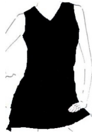
Fig. 7: Undecorated Garment

Under Section 113(b), because the cut and shape of a garment define the “useful article as such,” respondents could not preclude anyone from manufacturing this garment: