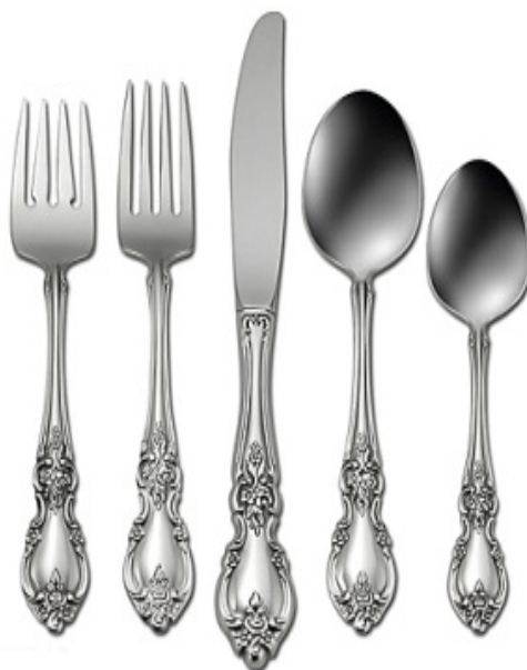
Fig. 10: Flatware with Floral Relief Design

Essentially any work that would be subject to the separability test to begin with—that is, any work that could be characterized as the “design of a useful article”—is likely to have some correlation with the optimal shape of its intended display medium. Congress did not intend that sort of relationship to preclude copyright protection. Congress understood, for example, that “a floral relief design on silver flatware” would be copyrightable under Section 101. 1976 House Report 55. As illustrated below, however, such a design must necessarily conform to the (noncopyrightable) shape of the flatware, and would need to be resized or otherwise adjusted for wider or narrower flatware: