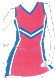
Fig 8: Garment Copying Respondents’ Drawing

But under Section 113(a), they would have the exclusive right to reproduce one of their drawings on that garment, to make it look like this: