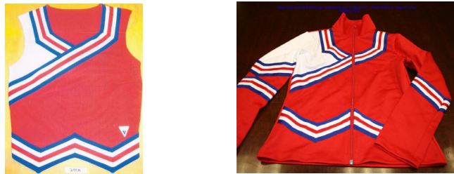
Fig. 9: Decorated Top and Decorated Jacket

3. Petitioner contends (Br. 48-49) that respondents’ decorations are inseparable from the garments depicted in their deposit materials because the decorations reflect an awareness of, and were intended to correspond to, the (noncopyrightable) shapes of those garments. The force of that contention is substantially undercut by evidence that respondents’ decorations “are transferrable to” other types of garments, Pet. App. 46a, as illustrated below: