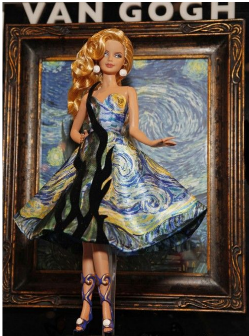
Fig. 4: Doll in The Starry Night Dress

It is therefore undisputed that a copyright in a pictorial work extends to the reproduction of that work on a garment. In particular, although petitioner’s brief does not cite Section 113(a), petitioner recognizes (Br. 54) that the owner of a copyright in Vincent Van Gogh’s The Starry Night would have the exclusive right to print it on a dress: