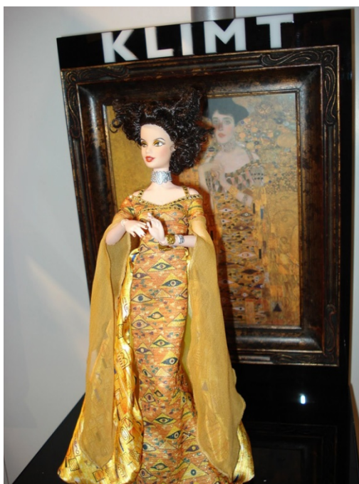
Fig. 6: Doll in Klimt Dress

3. As it comes to this Court, this case presents a situation indistinguishable from the ones just discussed. Petitioner “does not contest” (Br. 51) that the drawings respondents deposited with the Copyright Office to obtain registrations (Pet. App. 5a, 7a, 9a) are copyrightable as drawings. Nor, for present purposes, does petitioner contest that the garment decorations depicted in those drawings are creative enough to satisfy the Copyright Act’s originality requirement. See id. at 12a (observing that originality was contested but not decided below).