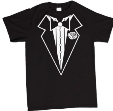
Fig. 3: “Tuxedo T-Shirt,” No. VA0001930383 (2014)

2. a. Respondents design and manufacture athletic clothing. Pet. App. 3a. On several occasions they have sought and received copyright registration for “two-dimensional” decorations for garments sold as cheerleading apparel. Id. at 4a. The Copyright Office based its decisions to register those decorations on specific materials that respondents were required to deposit with their registration applications. See 17 U.S.C. 408(b), 410.