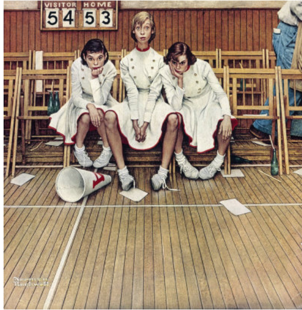
Fig. 12: Norman Rockwell, Cheerleaders (1952)

decorations evocative of cheerleading are not immutable, but have evolved over time: