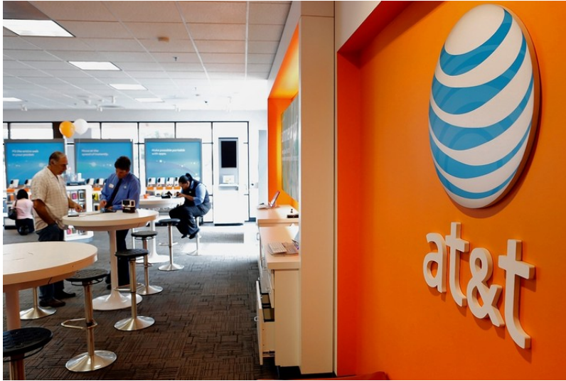
Phones like AT&T's that run on GSM have traded at a premium.