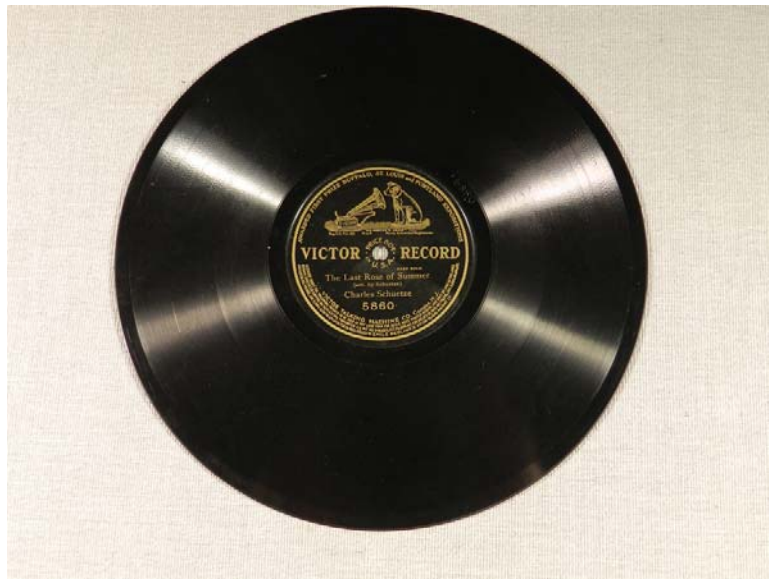
78 rpm shellac disc