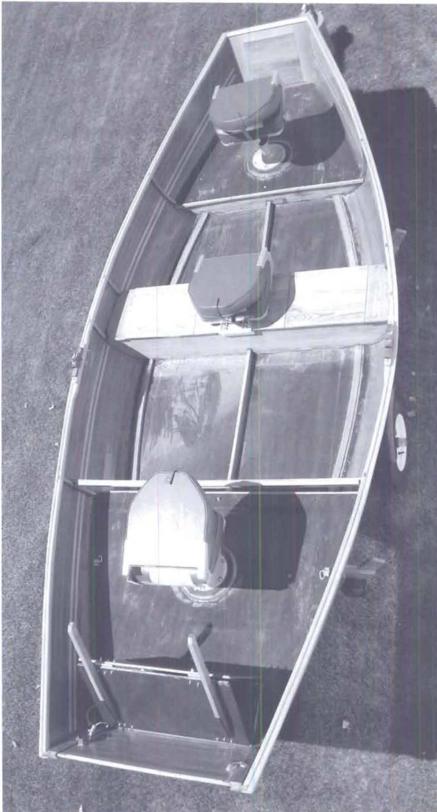
Aerial View – Palisades Skiff Drift Boat Snake River Wooden Boats, Inc.