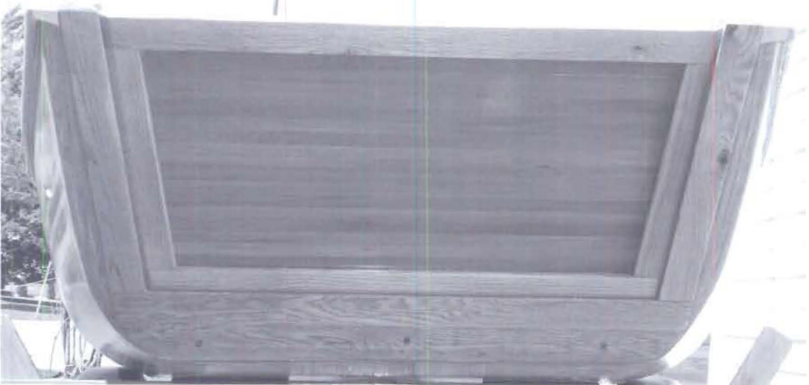
Trapezoidal Transom Gate/Curved Bilge