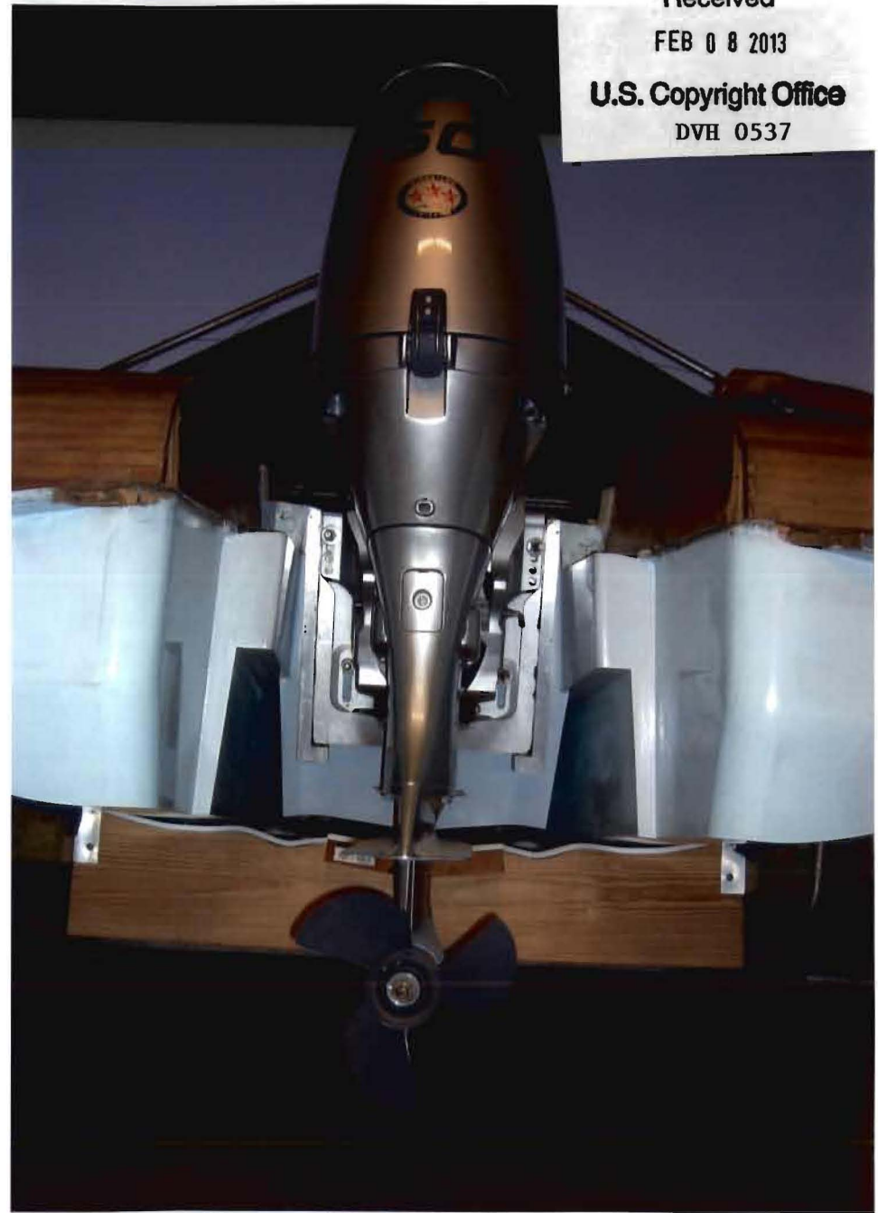
The 25' FLATS FLYER by GREEN HERON BOATWORKS

25' FLATS FLYER by Green Heron Boat Works