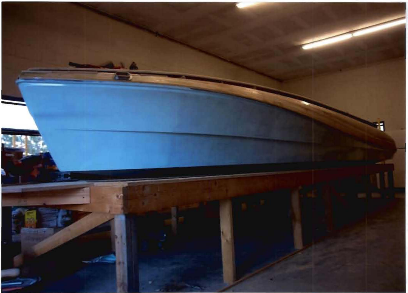
The 25' FLATS FLYER by Green Heron Boat Works