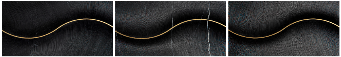
Dimensional Field Tile