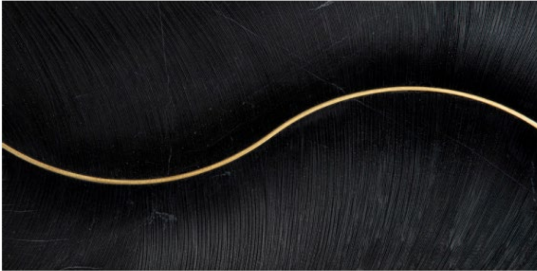
Cropped image of a single tile from the Work's deposit materials