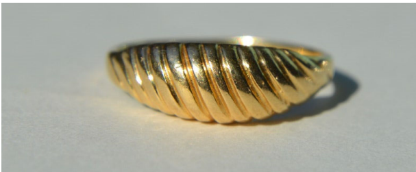
Shrimp ring 5

Similarly, the arrangement of elements in “Croissant”—using curved lines on a domed segment to create the appearance of nested shapes arranged by size—is commonly found in jewelry designs. See Feist , 499 U.S. at 362. For example, the Board identified the following jewelry pieces that utilize a similar arrangement: