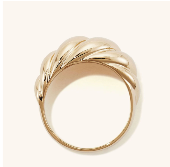
Croissant SR # 1-9469656061