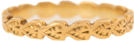
Gold eternity band c. 1900 2