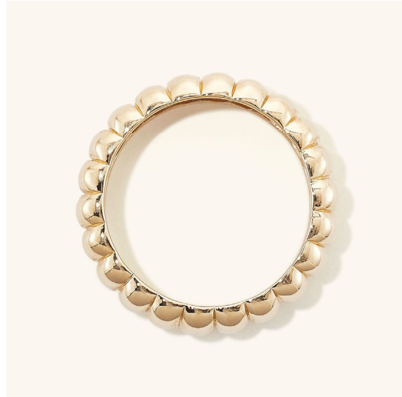
Charlotte SR # 1-9469656011