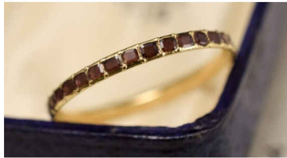
Garnet eternity band c. 1800 4

Similarly, the arrangement of elements in “Croissant”—using curved lines on a domed segment to create the appearance of nested shapes arranged by size—is commonly found in jewelry designs. See Feist , 499 U.S. at 362. For example, the Board identified the following jewelry pieces that utilize a similar arrangement: