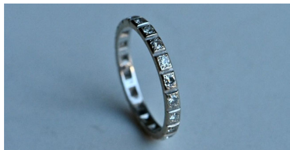
Diamond eternity band c. 1920s–1930s 1

Second, the Works are not protectable when evaluated as a whole. Each Work consists of a few simple elements, which are not sufficiently numerous to render it protectable. See Satava v. Lowry , 323 F.3d 805, 811 (9th Cir. 2003). Nor is the selection or arrangement of the elements sufficiently original in either Work. Feist , 499 U.S. at 358. The arrangement in “Charlotte” consists of placing the identically sized elements in a continuous pattern around the band. This particular arrangement has been a mainstay of eternity bands for centuries. For example, the Board identified the following jewelry pieces that utilize a similar arrangement: