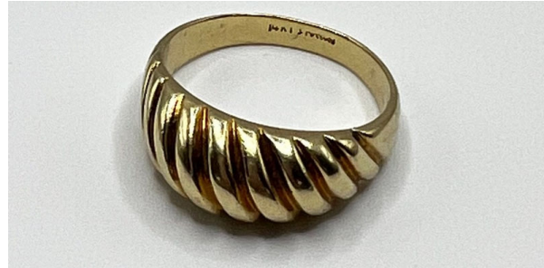
Shrimp ring 8

Mejuri argues that the choices it made in shaping the Works render them protectable, appealing to language in the Compendium that jewelry designs can be created through shaping the work and that a jewelry design may be registered if the shape of an element is sufficiently original. Charlotte Second Request at 1; Croissant Second Request at 1; see also COMPENDIUM (THIRD) §§ 908.2, 908.3. Specifically, Mejuri opines that the shaping choices in “Charlotte” “that give[] it the appearance of ladyfingers arranged in a cake” and the shaping choices in “Croissant” “that give[] it the appearance of a croissant that has been baked” are sufficiently creative to warrant protection. Charlotte Second Request at 1; Croissant Second Request at 1. Mejuri also contrasts “Croissant” with its own simple domed ring design that it describes as the “predecessor” to “Croissant,” which it concedes is not protectable. Croissant Second Request at 2–3. It argues that the “croissant-like shaping” of “Croissant” renders the ring design more creative than, and thus distinguishable from, the unprotectable domed design. Id. In essence, Mejuri argues that the resulting pastry-like appearance of each Work “is not a mere variation on a common or standardized design (like a solitaire ring) or familiar symbol (like a standard cross) or made up of only commonplace elements arranged in a common manner (like a row of gemstones).” Id. at 4; Charlotte Second Request at 4.