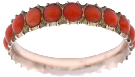
Coral eternity band c. early 1800s 3