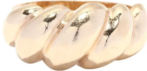
Domed croissant ring 6