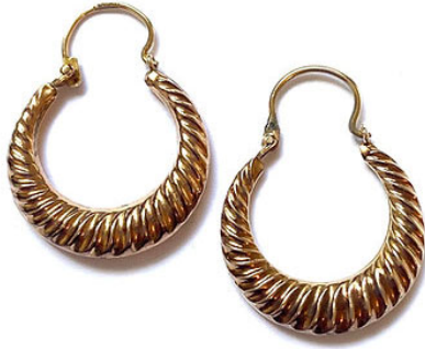
Croissant hoop earrings 7