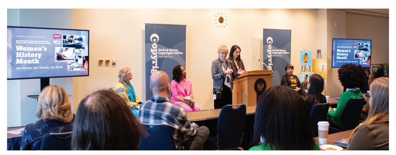
Copyright Office staff members showcase their creative works and highlight their experiences with copyright as creators at a Women's History Month event.

Throughout the year, the Office celebrated diversity by observing heritage and identity recognition months on social media, through blog posts, with messages from the Register, and with staff events—starting and ending the fiscal year with Hispanic Heritage Month, which spans from mid-September to mid-October. In FY 2023, the Office hosted its first copyright teas since the start of the pandemic. This included one cosponsored by the DEIA Committee to celebrate Women's History Month, which highlighted the creative talents of women in the Copyright Office.