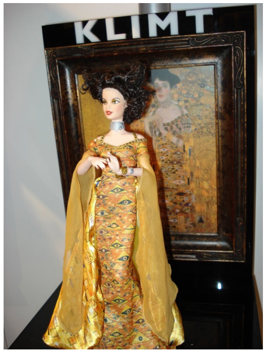
Fig. 6: Doll in Klimt Dress

3. As it comes to this Court, this case presents a situation indistinguishable from the ones just discussed. Petitioner "does not contest" (Br. 51) that the drawings respondents deposited with the Copyright Office to obtain registrations (Pet. App. 5a, 7a, 9a) are copyrightable as drawings. Nor, for present purposes, does petitioner contest that the garment decorations depicted in those drawings are creative enough to satisfy the Copyright Act's originality requirement. See id. at 12a (observing that originality was contested but not decided below).