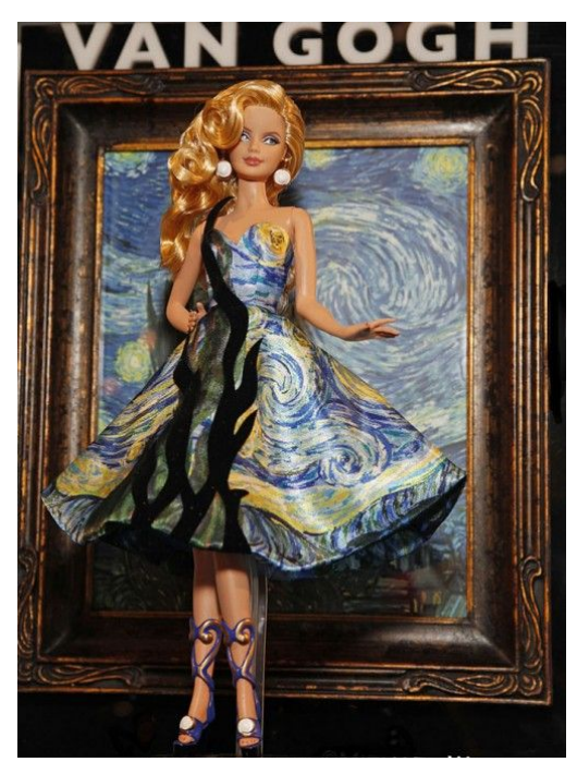
Fig. 4: Doll in The Starry Night Dress

It is therefore undisputed that a copyright in a pictorial work extends to the reproduction of that work on a garment. In particular, although petitioner's brief does not cite Section 113(a), petitioner recognizes (Br. 54) that the owner of a copyright in Vincent Van Gogh's The Starry Night would have the exclusive right to print it on a dress: