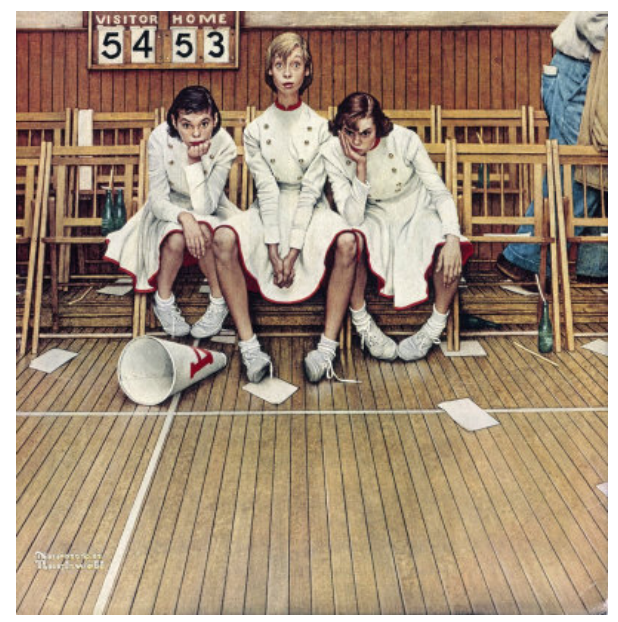
Fig. 12: Norman Rockwell, Cheerleaders (1952)

decorations evocative of cheerleading are not immutable, but have evolved over time: