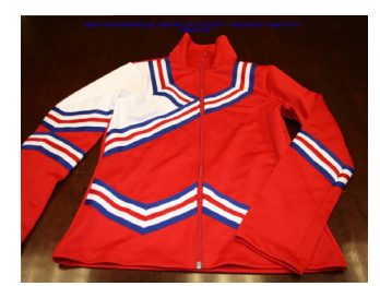
Fig. 9: Decorated Top and Decorated Jacket

But even accepting that respondents' designs were intended to, and do, look best on garments of certain shapes, those designs remain conceptually separable