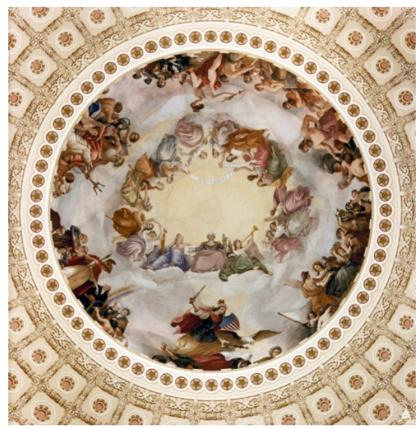
Fig. 11: Constantino Brumidi, The Apotheosis of Washington (1865)

More generally, much (if not all) artwork is influenced to at least some degree by the shape of its intended display medium. The Starry Night would look different if Van Gogh had painted it on a differently proportioned canvas. So too would Constantino Brumidi's The Apotheosis of Washington (reproduced below), which Brumidi painted on a commission "to furnish a design for 'a picture 65 feet in diameter, painted in fresco, on the concave canopy over the eye of the new dome of the U.S. Capitol," and which accordingly includes figures arranged in a circular pattern and "painted to be intelligible from close up as well as from 180 feet below." Architect of the Capitol, Apotheosis of Washington, https://www.aoc.gov/art/other-paintings-and-murals/apotheosis-washington (last visited Sept. 19, 2016).