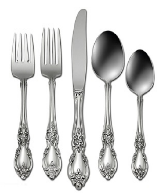
Fig. 10: Flatware with Floral Relief Design

Essentially any work that would be subject to the separability test to begin with—that is, any work that could be characterized as the "design of a useful article"—is likely to have some correlation with the optimal shape of its intended display medium. Congress did not intend that sort of relationship to preclude copyright protection. Congress understood, for example, that "a floral relief design on silver flatware" would be copyrightable under Section 101. 1976 House Report 55. As illustrated below, however, such a design must necessarily conform to the (noncopyrightable) shape of the flatware, and would need to be resized or otherwise adjusted for wider or narrower flatware: