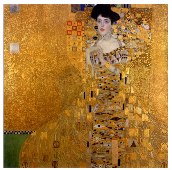
Fig. 5: Gustav Klimt, Portrait of Adele Bloch-Bauer I (1907)

Klimt appears to have imagined the dress in the painting rather than basing it on an actual dress, see Susan Stamberg, Immortalized as "The Woman in Gold," How a Young Jew Became a Secular Icon, NPR (June 23, 2015), http://www.npr.org/2015/06/23/416518188/immortalized-as-the-woman-in-gold-how-a-young-jew-became-a-secular-icon, and the painting clearly exhibits the "modicum of creativity" that is required for copyright protection, Feist Publ'ns, Inc. v. Rural Tel. Serv. Co., 499 U.S. 340, 346 (1991). Accordingly, the scope of a copyright in the Klimt painting would be the same as the scope of a copyright in The Starry Night.