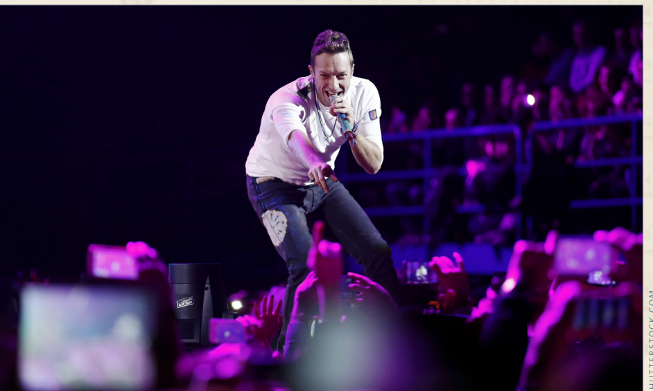
The band Coldplay hit the top spot in the Hot 100 charts with the song "Viva La Vida" in the summer of 2008.