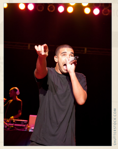
Drake's song "In My Feelings" is at number one

What other future memory-triggering songs will hit number one this summer? We'll just have to wait and see. But thanks to the creativity of all the songwriters and performers, songs will continue to bring back memories of summers past. @