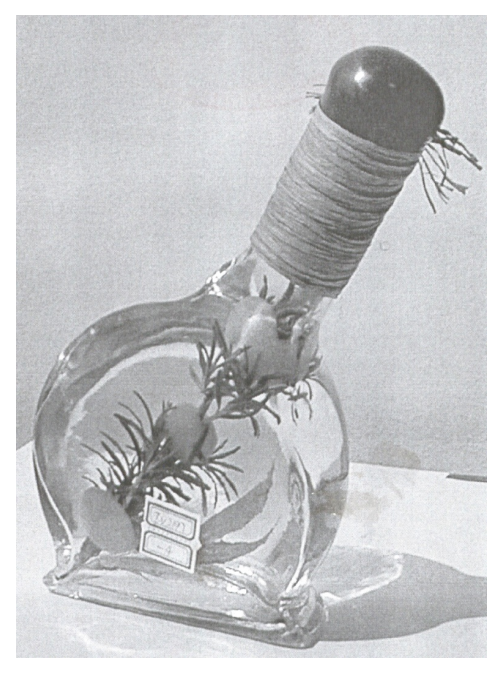
FANCIFUL ORNAMENTAL BOTTLE DESIGN #7