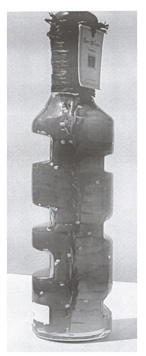
FANCIFUL ORNAMENTAL BOTTLE DESIGN #9