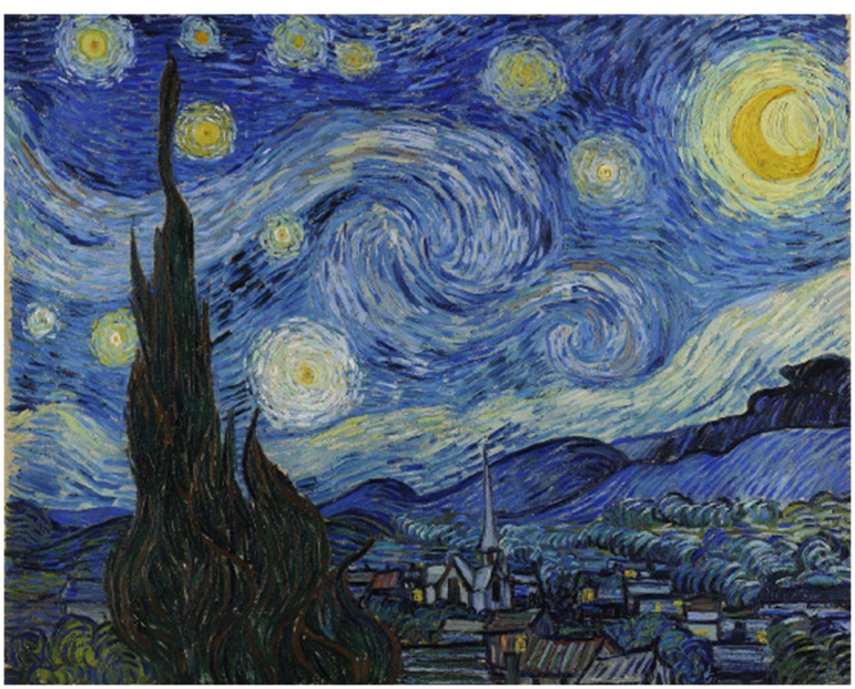
Vincent Van Gogh's The Starry Night (style image)