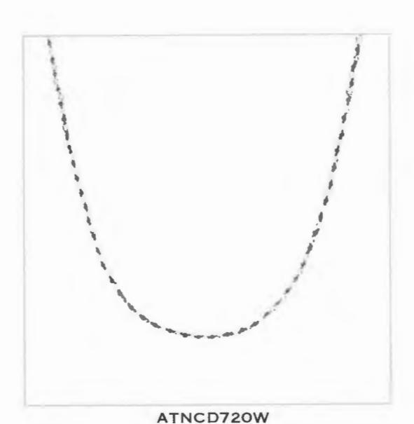
WHITE MARQUIS ROSE CUT DIAMOND NECKLACE, 16", 18K RECYCLED WHITE GOLD, 6.48 TCW

WHITE MARQUIS ROSE CUT DIAMOND NECKLACE, 18", 18K RECYCLED WHITE GOLD, 7.02 TCW