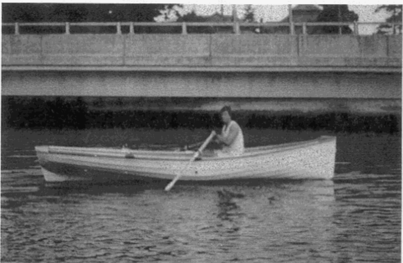
ROUNDBACK SURFBOAT 8-20-00 (KEEL EXTENSION) 6/2001