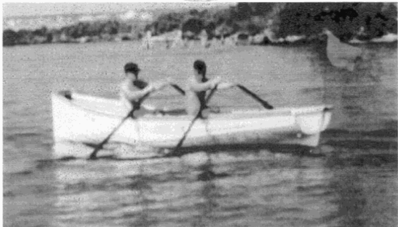
SELF BAILING OPEN STERN 7/01