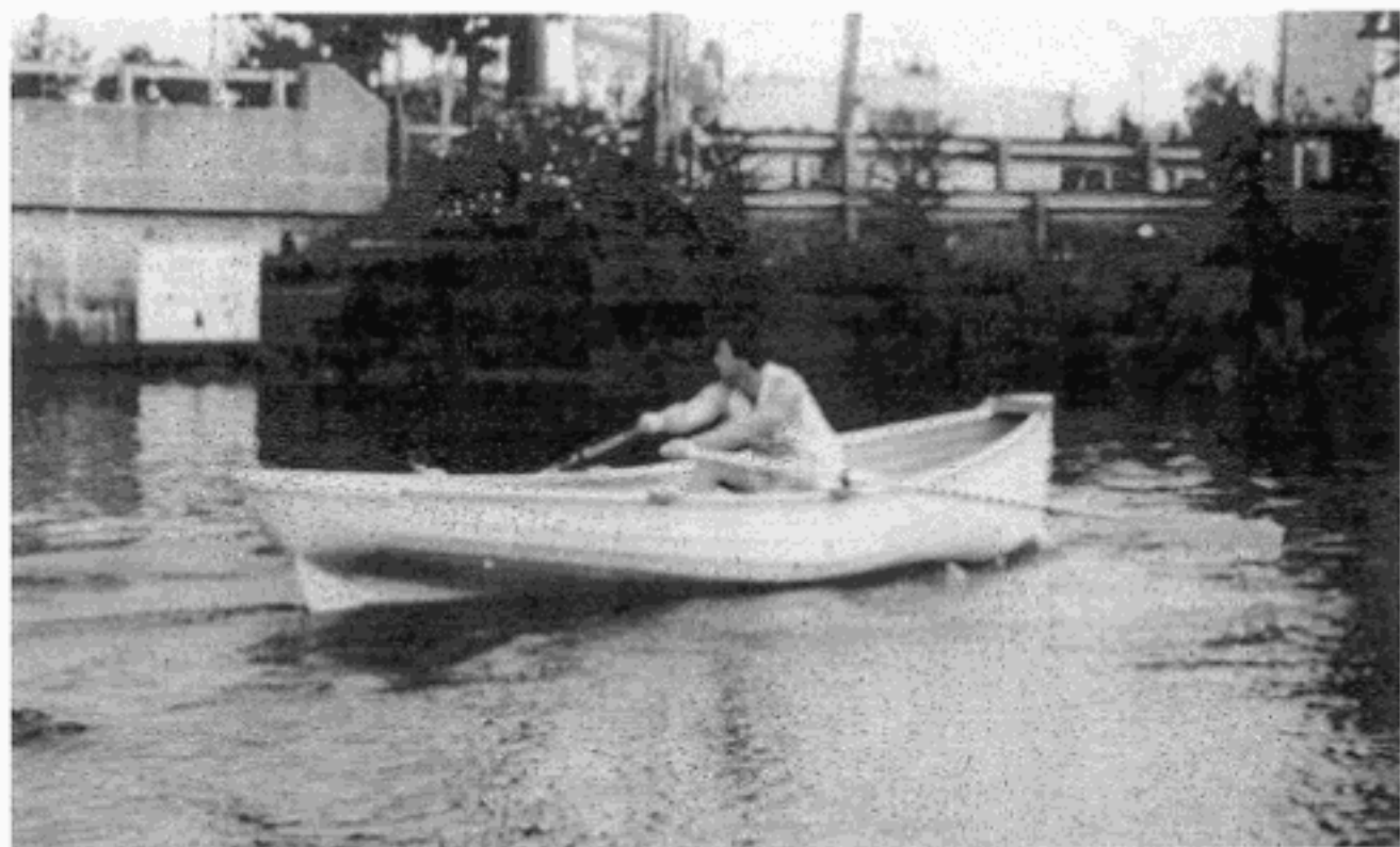
ROUND BACK SURFBOAT 8-20-00 KEEL EXTENSION 6/2001