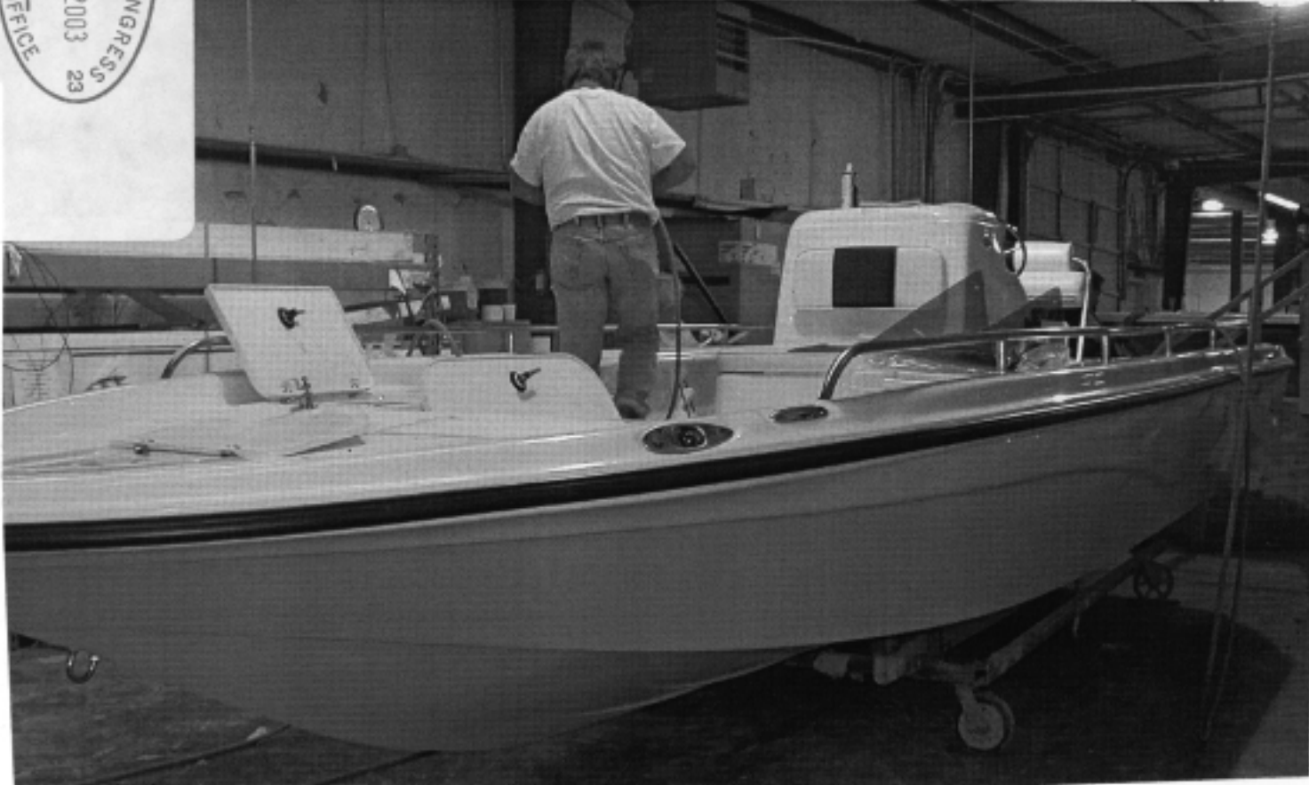
② FISHMASTER 2450 BB BAY BOAT PORT SIDE VIEW COMPLETED BOAT HULL

LIBRARY OF CONGRESS COPYRIGHT OFFICE SEP 05 2003 23 COPY