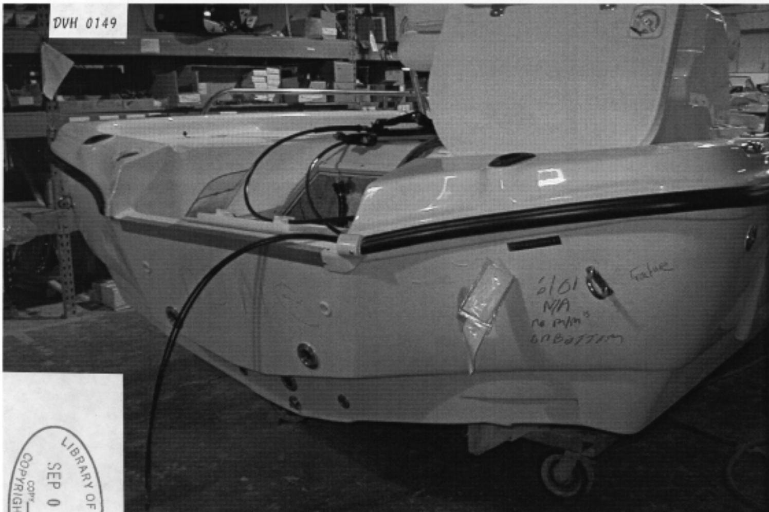
FISHMASTER 2450 TRANSON VIEW 2450 BB BAY BOAT

LIBRARY OF CONGRESS COPYRIGHT OFFICE SEP 05 2003 23 COPY