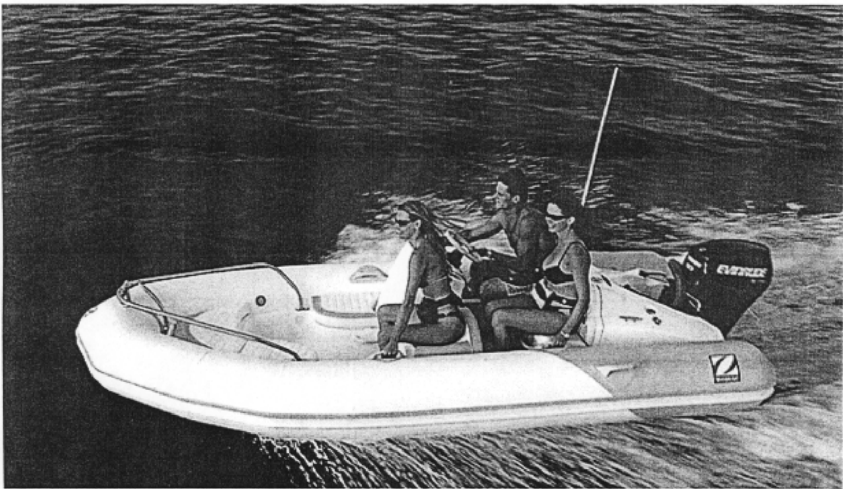
Zodiac Yachtline 470 Delmo